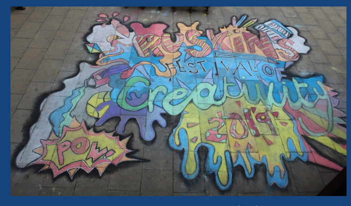
More photos on page 6

who took part - to visitors who brought a new dynamic to the Academy, to staff whose creative thinking led to some truly inspirational sessions and to students who whole-heartedly embraced the festival - demonstrating that intangible but incredibly special 'Ruskin spirit' once again.