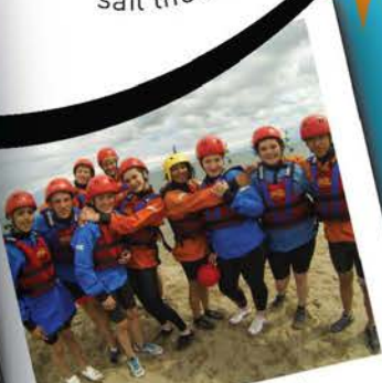
Sailing and Windsurfing