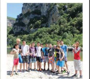
A rest before Kayaking another 12km