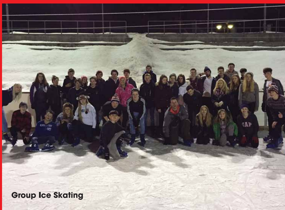
Group Ice Skating

During half term, eighteen students from Ruskin, along with students from the other Federation academies travelled to Bardonecchia, Italy, on the annual ski trip. The trip was a huge success and the group had a great time and made new friends whilst learning new skills and having fun. During the week they enjoyed ice skating, bum boarding and even dined at a traditional Italian pizzeria. The students were a credit to both the Academy and themselves. Some are already looking forward to the next ski trip to Folgaria, Italy, during February half term 2016.