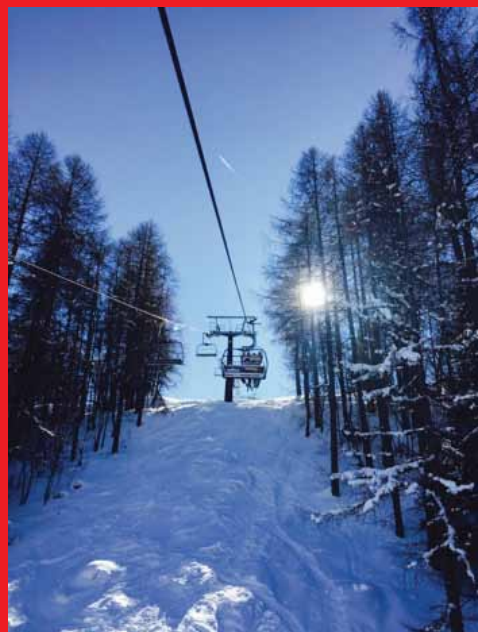
Beautiful morning on the chair lift